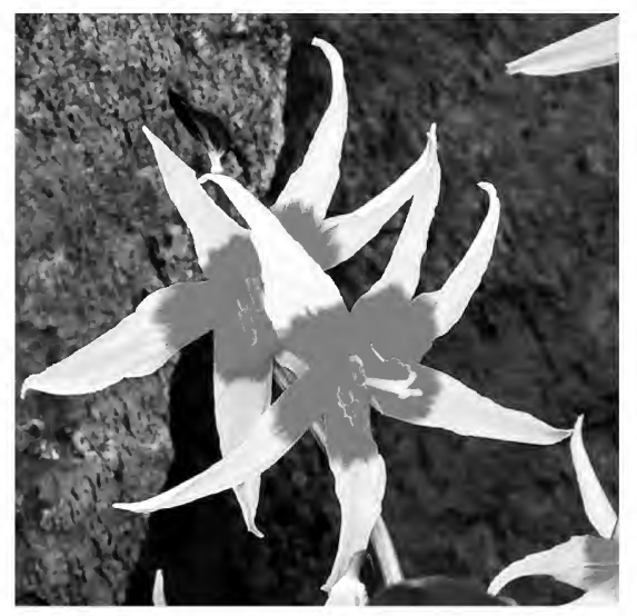
Kaweah Lakes fawn lily ( Erythronium pusaterii) 2010.